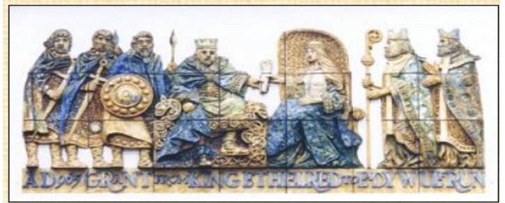
This ceramic shows Ethelred handing the charter to Lady Wulfruna