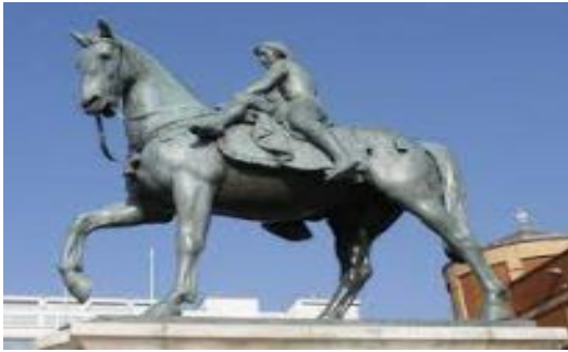
The statue of Lady Godiva in Coventry