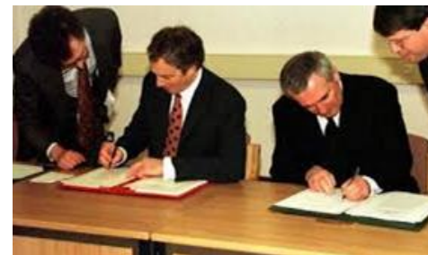
Tony Blair and Bertie Ahern sign the Belfast Agreement.

The Good Friday Agreement was signed on April 10, 1998. It was an accord (agreement) between representatives of Ireland and the British government of Northern Ireland. The Good Friday Agreement brought an end to the period known as the Troubles in Northern Ireland.