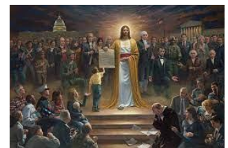
Jesus giving his peace.

Children of God are peacemakers. They help bring people to God and they do their best to get along with everyone. Peacemakers try to stop people fighting and Christians believe that when you go to make peace, Jesus will go with you. Jesus taught this message because when you make peace, you reflect the likeness of God.