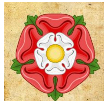
The Tudor Rose