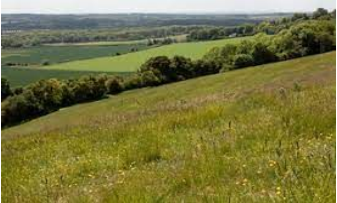
Westerham Heights (the highest point in London)