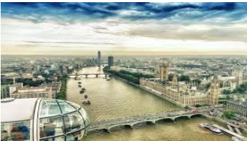
The River Thames