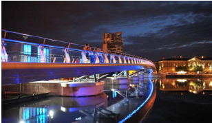
Human Feature – Lagan Weir Bridge