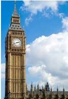
Elizabeth Tower Big Ben