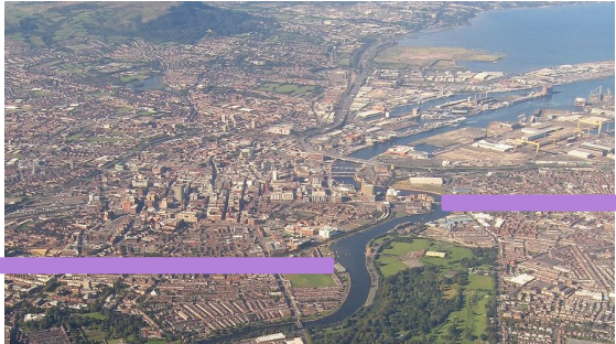
Physical Feature – The River Lagan